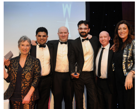
United Wholesale Grocers (Springburn) won Best Cash & Carry in 2017. The category was sponsored by JTI