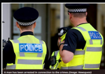
A man has been arrested in connection to the crimes

2021 MAY POLICE SCOTLAND CRIME HAMILTON SCOTLAND